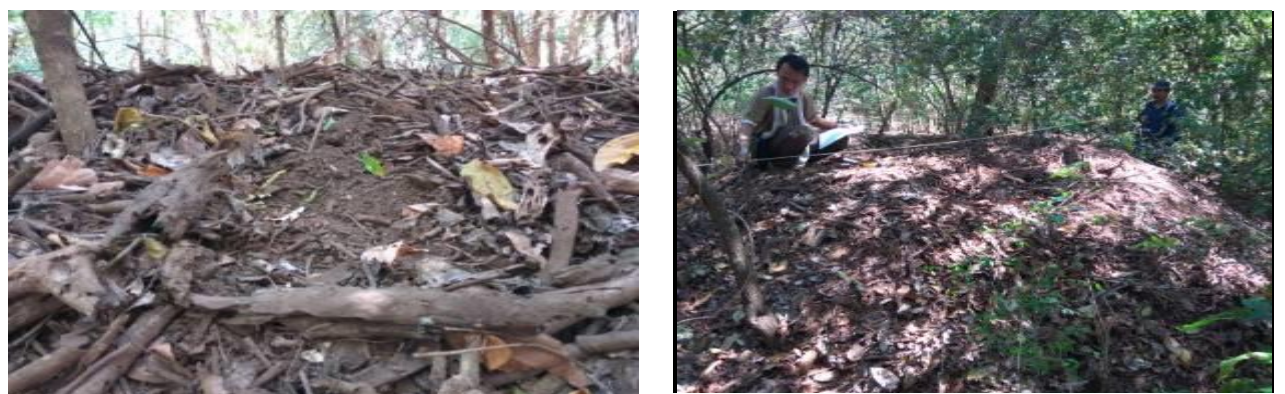
Figure 1 Profile of Megapodius reinwardt nest on Moyo Island 2017

Based on topography of Moyo Island which is hilly and mountainous, mostly in the form of forest, sea, the existence of human settlements and the accessibility is still relatively difficult and expensive, in this study the data collection about population distribution Megapodius reinwardt only conducted in the western part of the South Island of the five locations: in the area of Labuhan Haji hamlet, Berang Sedo hamlet, Ai Manis hamlet, Ai Dara and Tanjung Pasir. The description of Megapodius reinwardt's nest and its spreading on Island 2017 presented below. Moyo is