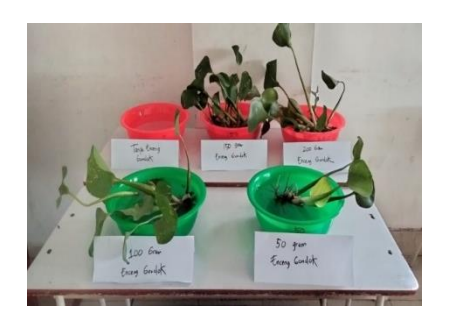
Figure 1. Water hyacinth Plants distribution

J. Pijar MIPA, Vol. 17 No. 6, November 2022: 804-808 DOI: 10.29303/jpm.v17i6.4107