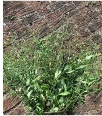
Figure 1. The process of drying Sambiloto leaves

The extract that is still mixed with the solvent is distilled at a temperature that matches the solvent's boiling point to obtain a thick extract, while the thick extract produced from this distillation process is 30 mL. Furthermore, Sambiloto leaf extract was tested against nails in a corrosive HCl medium and well water soaked for seven days. This test was carried out to determine the efficiency of the Sambiloto leaf extract inhibitor against the corrosion rate of nails by adding the Sambiloto leaf extract, which has varied concentrations of 1%, 5%, 10%, and 15% in the corrosive medium that has been provided, as shown in Figure 3.