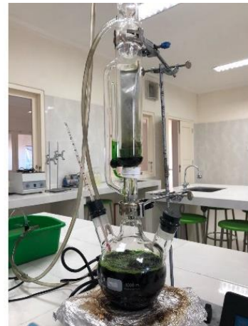
Figure 2. The process of extracting Sambiloto leaves using the soxhletation method

The inhibitor's ability to determine the corrosion rate of nails in the corrosive medium can be determined quantitatively using the following equation [8].