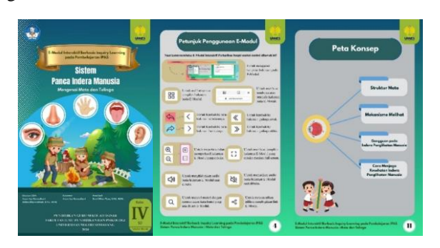
Figure 2. Cover, Instructions for Use, and Concept Maps on Topic A. Human Sense of Vision Interactive E-Module based on Inquiry Learning

The testing of Interactive E-Modules based on Inquiry Learning in the learning and teaching process was carried out on fourth-grade students in a large group of 20 students. The results of the development of Inquiry Learning-based Interactive E-Modules are presented in Figure 2-4.