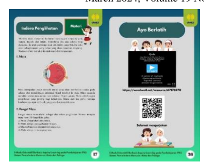
Figure 4. Learning Materials and Evaluation on Topic A. Human Sight Senses Interactive E-Module based on Inquiry Learning