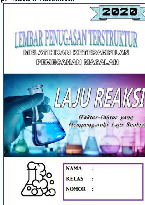
Figure 2 Cover View of SAS-PSS

some advice or maybe some critics. The appraisal for SAS was done by reviewing the content inside also the language that it used. Either already proper or not, the lecturer always gave his feedback to the SAS, so the SAS as the product can be as perfect as possible. After the SAS has been repaired based on the advice and critics, the SAS was ready to move in a further step, which a validation.