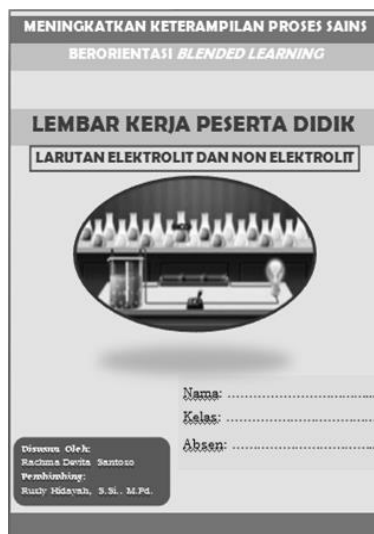
Gambar 4. Main Cover of Student Worksheets

The illustration of the image used in the Student Worksheets must be in accordance with the explanation presented so as not to cause misconceptions to students (Yanti, 2015). The use of fonts must be selected which is attractive and easy to read by using a proportional font size. In order for the Student Worksheets to