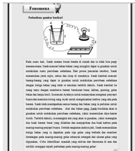
Gambar 2. Phenomenon Presented at LKPD

Based on Table 3, the second component is divided into two indicators, namely the accuracy of concepts and definitions, and the accuracy of pictures and illustrations. Both indicators get a percentage of 80% with valid criteria, which means that the two indicators related to the truth of the material contained in the Student Worksheets are in accordance with the blended learning component to improve Science Process Skills. The truth of the subject matter is the truth or suitability of the Student Worksheets content with the subject matter presented with the aim that students do not experience misconceptions.