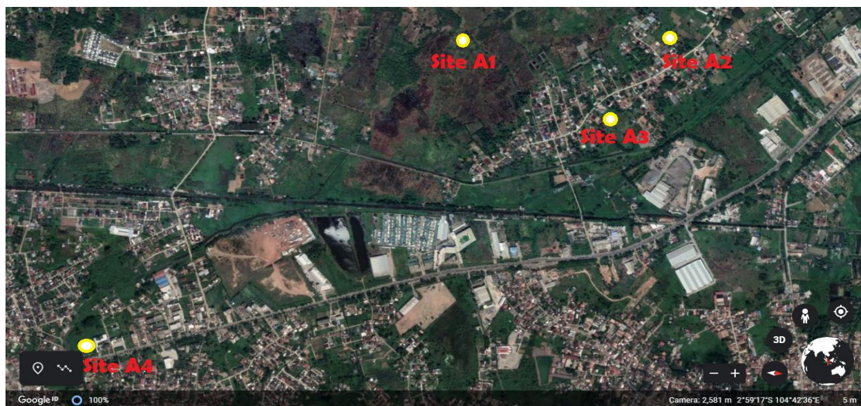
Figure 1. Research station located in lebak swamp in Bukit Baru, Palembang City consisting of 4 sites

This research was conducted in Bukit Baru, located in Palembang City, South Sumatra, Indonesia (Figure 1). In order to compare the biological diversity indicator in Lebak swamp. The study area is divided into 4 research sites, consisting of site A1 as natural swamp (control site), Site A2 and Site A3 as the site located around residential areas (Site A3 is more crowded human area and less vegetation), and Site A4 as the site located around highway.