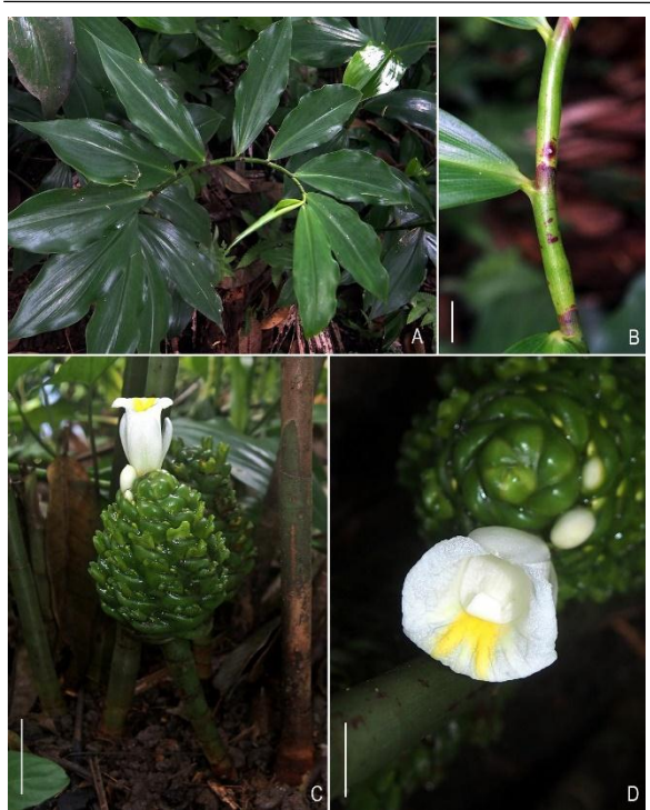
Figure 2. Costus dubius (Afzel.) K.Schum.: A, leafy shoot; B, close up of stem (scale = 1 cm); C, inflorescence (scale = 5 cm); D, flower (scale = 2 cm). All from Mustaqim & Setiawan 2303.