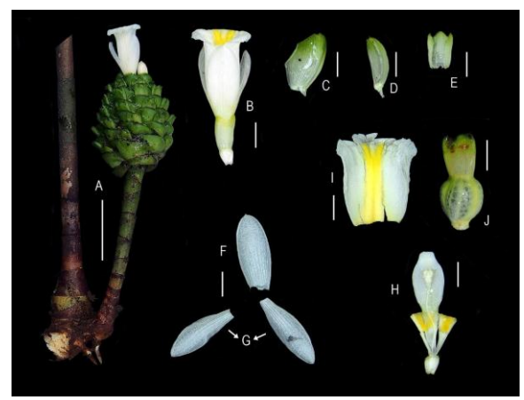
Figure 3. Costus dubius (Afzel.) K.Schum.: A, inflorescence from a separate leafless shoot (scale = 5 cm); B, flower (scale = 1 cm); C, bract (scale = 1 cm); D, bracteole (scale = 1 cm); E, calyx (scale = 1 cm); F, dorsal petal (scale = 1 cm); G, lateral petals (scale = 1 cm); H, floral part with perianth and labellum removed (scale = 1 cm); I, labellum (scale = 1 cm); J, capsule crowned by persistent calyx. All from Mustaqim & Setiawan 2303.