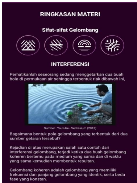
Figure 3. Display of the summary of wave interference material on the mobile pocket book on the topic of mechanical waves