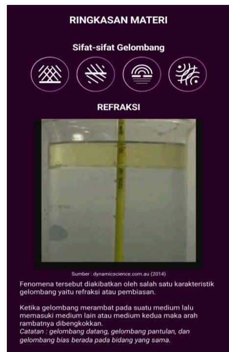
Figure 2. Display of a summary of material on wave refraction in the mobile pocket book on the topic of mechanical waves

book on the topic of mechanical waves as a learning media tool. Hastuti et al. (2016) stated that problem-based learning with the assistance of virtual media in the problem orientation stage makes it easier to understand the material with the presence of animated displays. This proves that problem-based learning with media assistance can develop thinking skills and enhance students' concepts mastery (Utami, 2020).