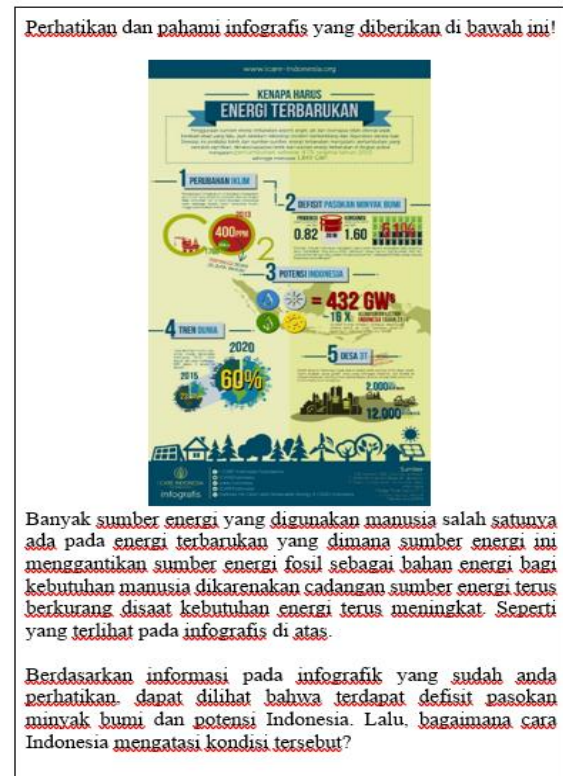
Figure 1. Science Literacy Test Instrument Items Identifying Problem Issues

answering the questions given. The following are students' answers to questions contained in 3 indicators of science literacy skills. Item number 2 with an indicator of identifying scientific issues can be seen in Figure 1.