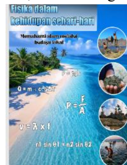
Figure 1. Cover Page of the Teaching Material

Introduction section includes the cover page, preface, instructions for using the module, table of contents, list of tables, concept map or topic overview, and learning objectives.