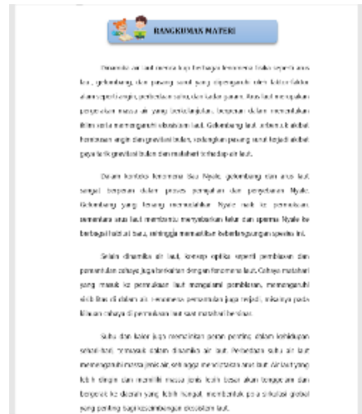
Figure 3. Closing Section of the Teaching Material

At the Develop stage, expert validation was conducted to assess the content, language, presentation, and integration of ethnoscience.