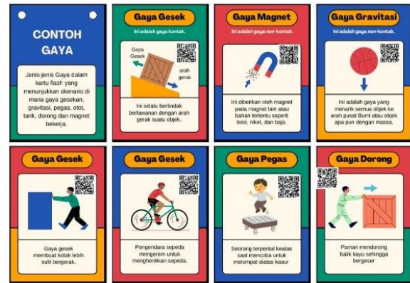
Figure 2. Flashcard

understanding of science concepts and knowledge retention due to their visual and memorable nature [19]. In line with this highlighted that flashcards help students develop ideas from images relevant to daily activities [29]. In this study, during the inquiry exploration stage, students could observe the flashcards to trigger questions ("Why is it difficult to push a box on a rough floor?"), formulate hypotheses and then conduct further investigations. Flashcards transformed abstract concepts into concrete and engaging starting points for inquiry.