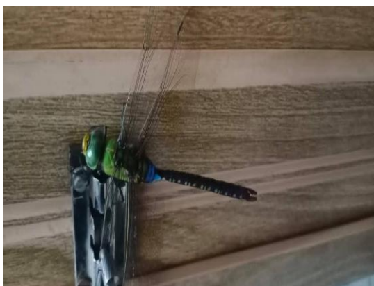
Figure 2. Adult male of Anax parthenope (Selys, 1839) photographed at Kudada village, outskirts of Jamshedpur, East Singhbhum district, Jharkhand

This observation represents the first confirmed record of Anax parthenope from the Jamshedpur region and an important addition to the odonate fauna of Jharkhand (Figure 2). The record provides presence-only data but contributes valuable baseline information for an underexplored region.