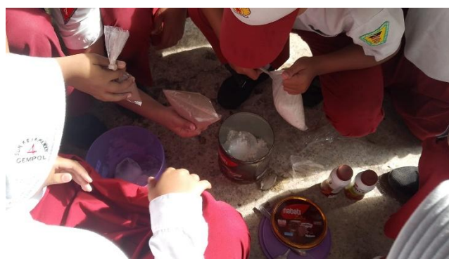
Figure 1. Ice Cream Making Experiments

Then, in the second meeting, students carried out the data collection stage through experimental activities: making ice cream with and without salt in groups using Student Worksheets (LKPD), during which they observed the freezing time and changes in the dough texture. The results of the observations were then analyzed, so that students and the teacher could conclude that salt can accelerate the freezing process. The learning activity ended with a reflection to evaluate the learning experience and encourage students to think creatively.