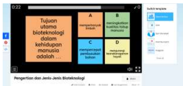
Figure 2. Wordwall quiz display on the biotechnology material

listened to the teacher's explanation but also actively answered questions, solved problems, and participated in healthy competition. The process of concept reinforcement through individually administered interactive quizzes conducted after group discussions allowed students to identify their misconceptions and immediately correct them based on the feedback they received.