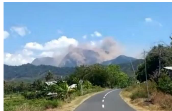
Figure 1. Debris due to landslide on the slope of Rinjani Mountain

The vibrations that occur during an earthquake can trigger landslides, as the results of research that previous researchers have conducted. A probabilistic model has been created by linking seismic parameters and geological, geotechnical, and geo-morphological information to assess the spot's potential. Trials of this method in southern Italy have shown promising results for the zoning of landslide-prone areas [1]. Rainfall information and earthquake parameters have been used as the trigger variables for landslides [2].